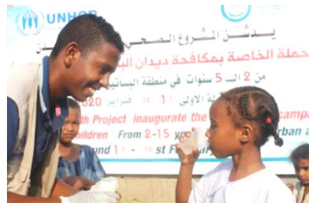
A community health worker provides a de-worming tablet to a young girl in Basateen neighbourhood, Aden governorate as part of UNHCR and partner CSSW's deworming campaign.

On 11 February, UNHCR and partner Charitable Society for Social Welfare (CSSW) launched a de-worming campaign in Basateen neighborhood, Aden governorate, to mitigate anemia and micronutrient deficiency among vulnerable children. Community health workers conducted door-to-door visits and provided de-worming tablets to 4,081 refugees and 1,749 IDPs, as well as host community children.