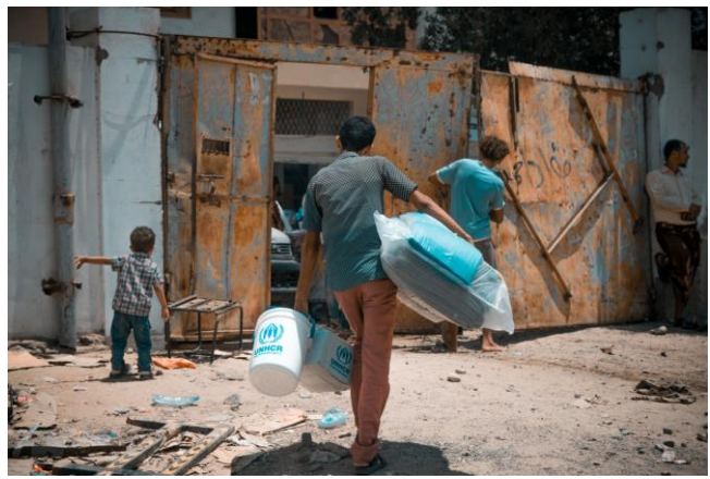
Displaced person leaving with relief items after a distribution led by UNHCR and the relief organisation Nahdha Makers Organisation (NMO), in Aden, to assist families displaced by the fighting in Al Hudaydah © UNHCR/NMO.

Number of refugees and asylum-seekers in Aden and Al Mukalla hubs, UNHCR February 2020