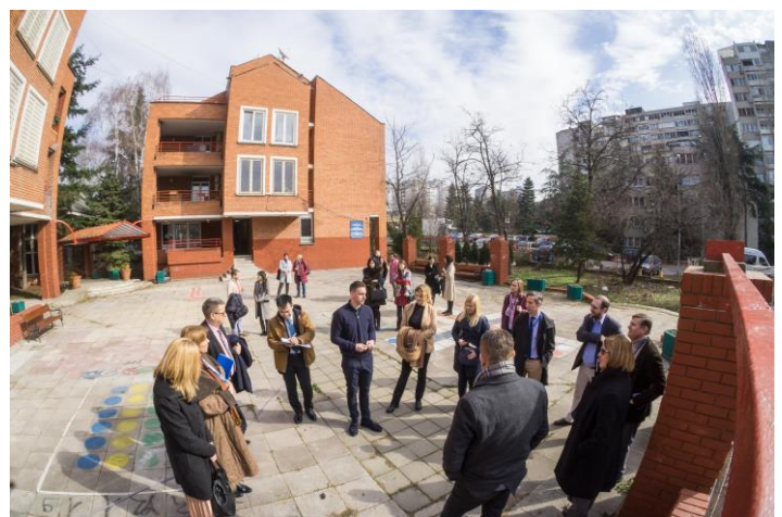
The Ministry of Labour, Employment, Veterans and Social Affairs, UNHCR and potential donors visit special centres for unaccompanied and separated refugee children in Belgrade, ©UNHCR, February 2019

CO in Belgrade and FU in South Serbia for regular protection monitoring in five Asylum Centres and 25 other sites across the country