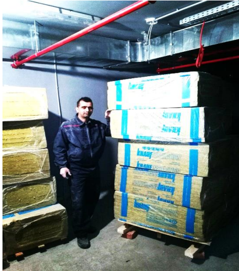
Notwithstanding the COVID-19 situation, UNHCR assisted this refugee to secure employment with a reputable construction company, ©UNHCR, March 2020