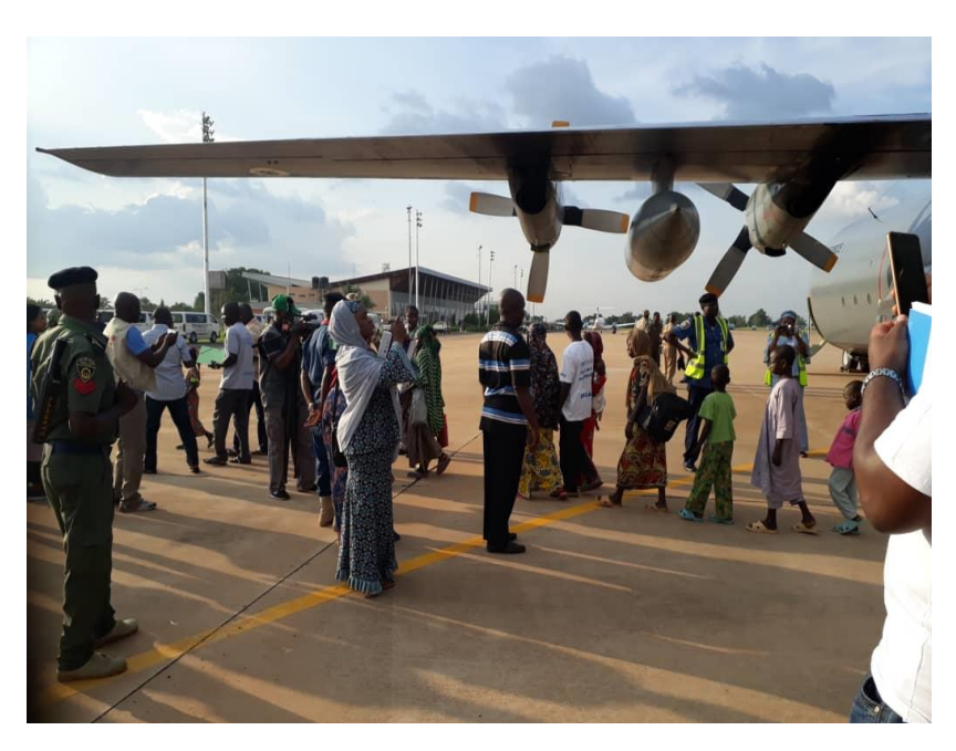
Refugee repatriated from Cameroon arrived to Yola, Adamawa State. UNHCR/ 2019