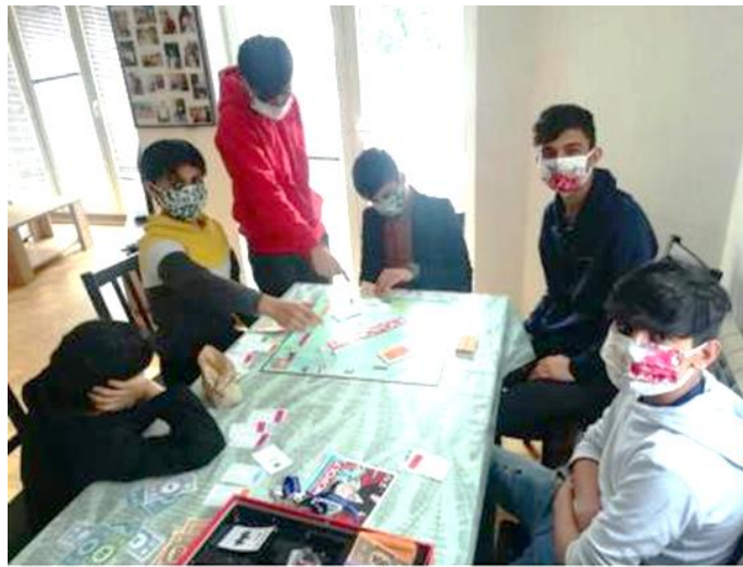
UASC in JRS Pedro Arrupe Shelter, Belgrade, ©JRS, March 2020