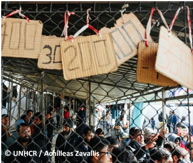
Refugees on the island of Lesbos

UNHCR has continued all critical activities and services on the islands while fully adhering to Government-adopted COVID-19 prevention measures. The Greek Government has introduced timebound preventative measures which include the suspension of asylum services and the regulated movement of asylum-seekers in and out of the reception centres. Restrictions may have an impact on some of the planned rapid response actions but UNHCR is already supporting with core relief items, cash card top-ups, communication with and mobilisation of communities and establishing medical response facilities. In order to effectively combat any public health emergency, refugees and asylum-seekers are in need of support, especially in regard to sufficient prevention measures, and access to adequate health facilities and services.