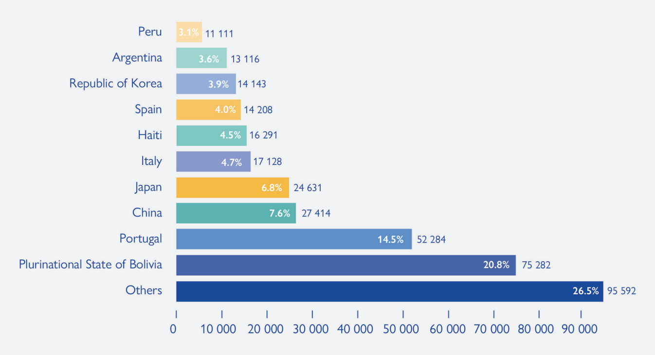
Figure 1: Numbers of migrants registred in São Paulo by country of origin, June 2019

São Paulo has been a destination city particularly for immigrants coming from Portugal, Italy, Spain and Germany since the nineteenth century, and Japan, China and Angola since the twentieth century. Migration from Latin American countries, such as Peru and the Plurinational State of Bolivia, as well as migration from Haiti and different African countries, is a more recent phenomenon. Today's migration to São Paulo is very diversified.