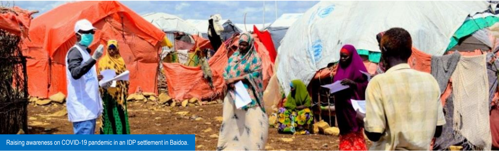
Raising awareness on COVID-19 pandemic in an IDP settlement in Baidoa.