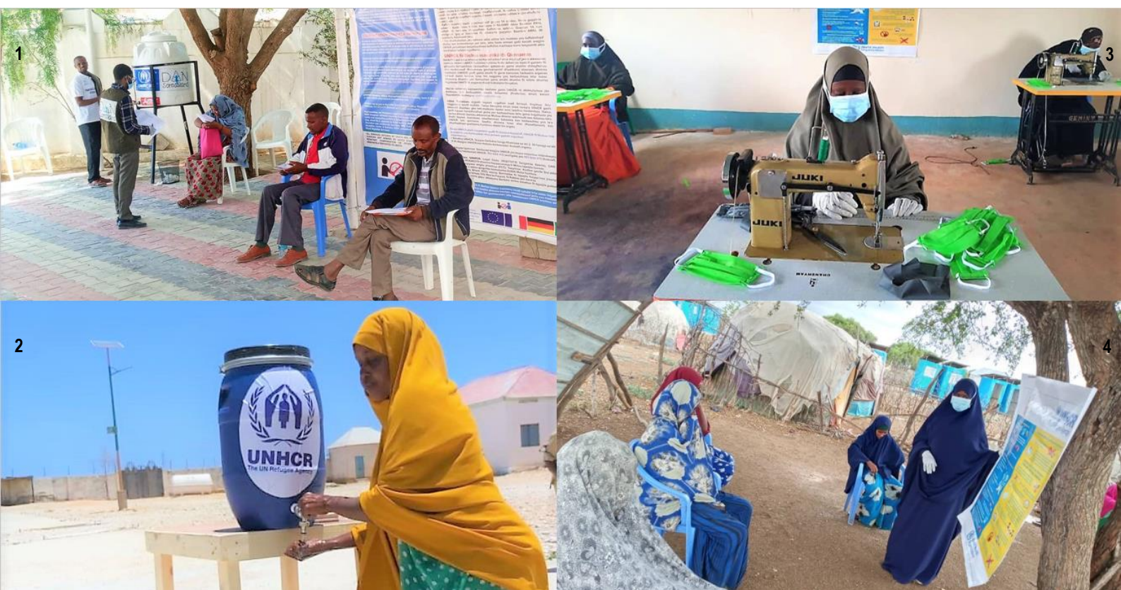
1 Refugees receiving monthly cash assistance in Hargeisa. 2 An asylum-seeker washing hands before entering the reception centre to collect a hygiene kit. 3 IDPs, returned refugees and members of host community producing face masks in Baidoa. 4 Raising awareness on COVID-19 in an IDP settlement in Baidoa.

UNHCR is grateful for the generous contributions of donors who have directly contributed to the Somalia operation