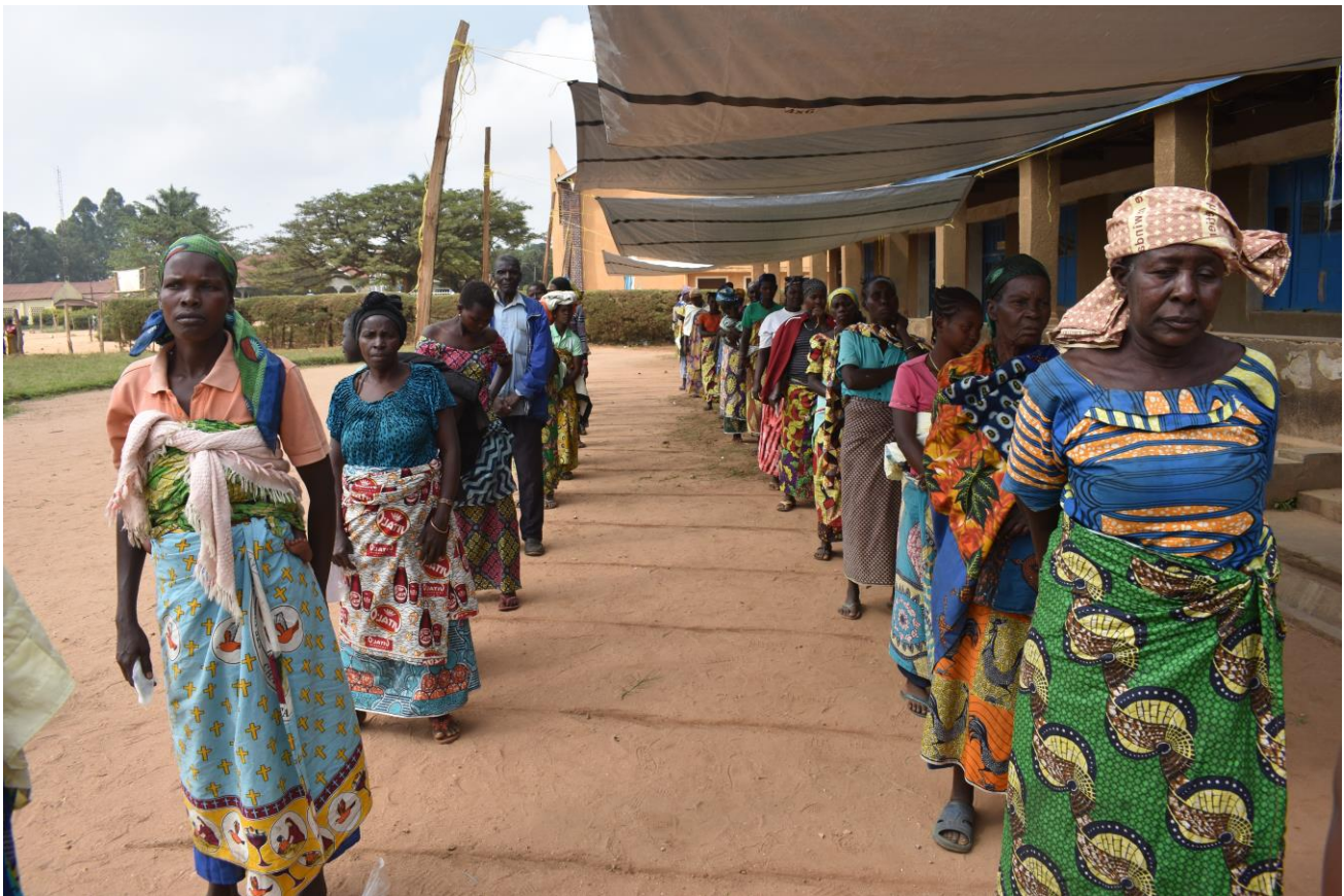
Vulnerable internally displaced women wait in line for their cash assistance, while respecting social distancing measures.