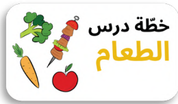
Lesson Plan الطعام.pdf