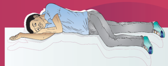
Other flu-like symptoms such as a running nose, sneezing and body weakness