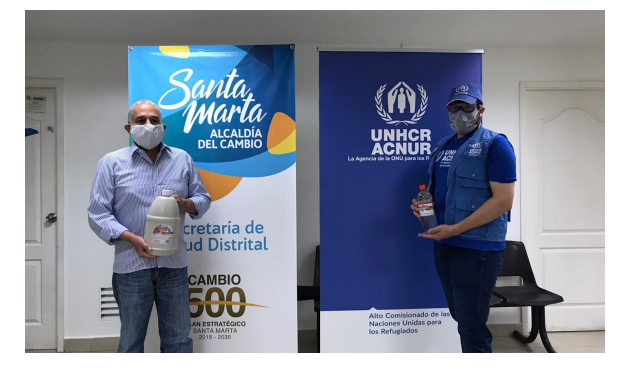
In Santa Marta, UNHCR donated 100 gallons of liquid soap and 500 litres of antiseptic soap to the District Health Program.

UNHCR, in coordination with the local GIFMM, delivered 100 gallons of liquid soap and 500 liters of antiseptic soap to the District Health Program in Santa Marta. In Medellin, UNHCR led the GIFMM health workgroup response in 2 temporary shelters set up by the Mayor's Office with capacity for 430 people. The primary health work plan includes triage upon entry into the shelter (taking temperature and checking for COVID-19 symptoms, etc.) and the set-up of isolation units respecting the health guidelines.