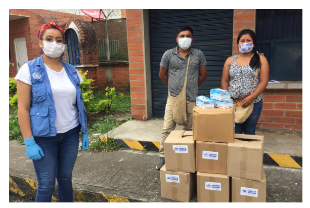
In Tumaco, Nariño, 400 pieces of Personal Protective Equipment were delivered to territorial organizations, Afro and indigenous populations, and leaders of the Nariño-Venezuela Brothers Without Borders Network to continue their work on behalf of refugees and migrants.

Austria, Canada, Central Emergency Response Fund (CERF), Chanel Foundation, Denmark, European Union, Germany, Ireland, Japan, Republic of Korea, KOICA, Luxembourg, Netherlands, Norway, Sweden, Switzerland, UN Human Security Trust Fund (UN HSTF), UN Peacebuilding Fund, Switzerland, United Kingdom and the United States of America.