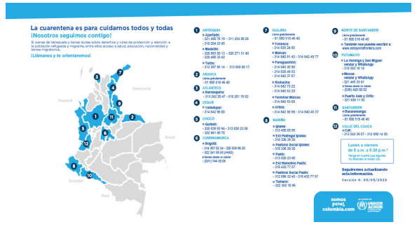
An updated version of the phone numbers for UNHCR's Information and Orientation Centres was published by Somos Panas Colombia.

In collaboration with UNAIDS, UNHCR produced an <u>informational video</u> on the protection needs of people with HIV within the context of COVID-19. A new <u>pamphlet</u> containing information on UNHCR helplines and call centers was distributed on various social media platforms.