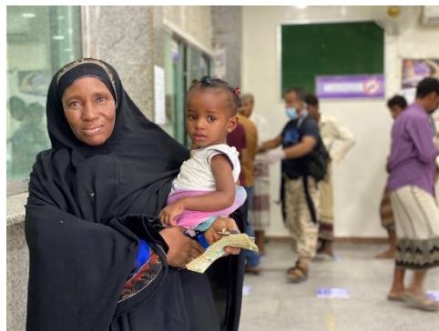
A 48-year-old Somali refugee and her granddaughter visit a bank in Aden to receive UNHCR cash assistance. The money she receives will help her meet the immediate needs for her daughter and grandchildren, including food and rent.

Reports of stigmatization and discrimination against refugees are increasing following the announcement of the first COVID-19 related death of a Somali refugee in Sana'a, including harassment and verbal abuse. UNHCR is scaling-up its CwC to reinforce wider and more effective messaging, to encourage tolerance both among authorities and local populations towards vulnerable communities fleeing conflict and persecution. Given the now universal threat of COVID-19, UNHCR is working to ensure a response that includes all levels of the community without distinction of origin or status.