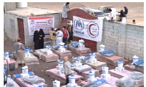
Basic household item distributions are prepared for families affected by floods in Marib governorate.

As the CCCM lead, UNHCR continues to work with WASH partners to emphasize the needs of 600 most-at-risk IDP hosting sites. CCCM partners continue working with IDP committees on identifying and referring suspected cases to the COVID-19 Rapid Response Teams, setting up community isolation spaces as required. Installation and community management of handwashing stations are also underway.