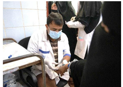
A UNHCR humanitarian health partner in Aden conducts COVID-19 testing for refugee men and women to determine the current impact of the virus in the city and help limit its spread.

Special thanks to our major donors: Thani Bin Abdullah Bin Thani Al-Thani Humanitarian Fund | United States of America | Sweden | Denmark | Norway | Netherlands | United Kingdom | Germany | Switzerland | Japan | Canada | Private Donors Spain | Kuwait Society for Relief | Private Donors Republic of Korea.