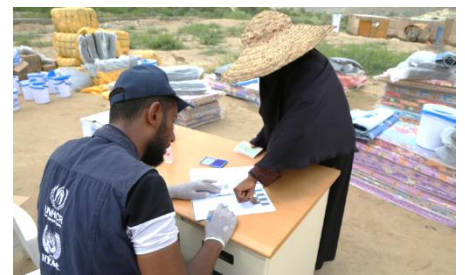
A displaced Yemeni woman identifies her name on the list at a basic household item distribution site in Lahj governorate. UNHCR provided basic items to a total of 1,000 displaced families that were affected by the recent rain and flash floods.