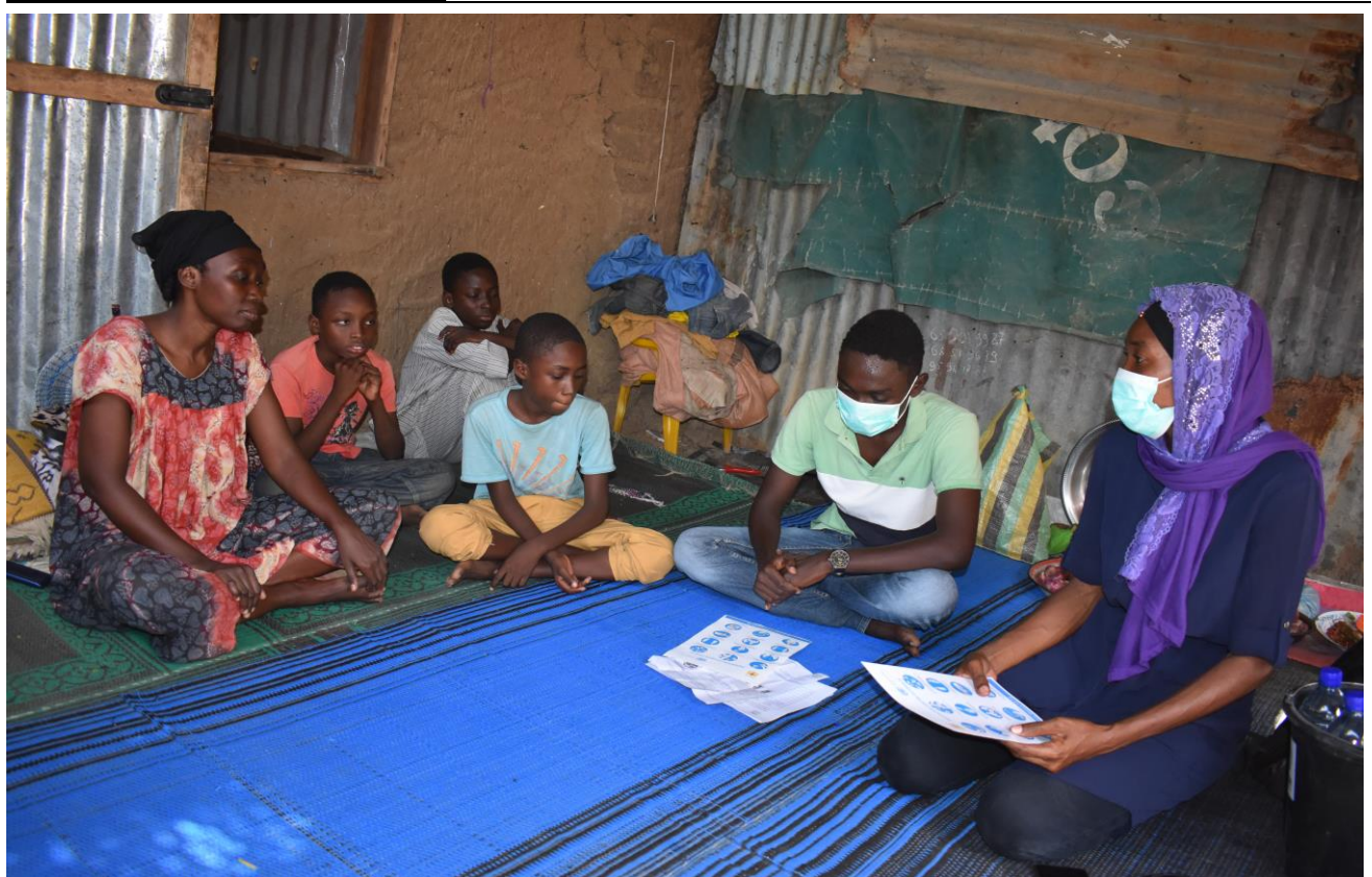
Awareness raising session on COVID-19 and sensitization on basic social distancing and hygiene measures conducted by refugees in N-Djamena (Chad) to curb the spread of the virus in their communities.