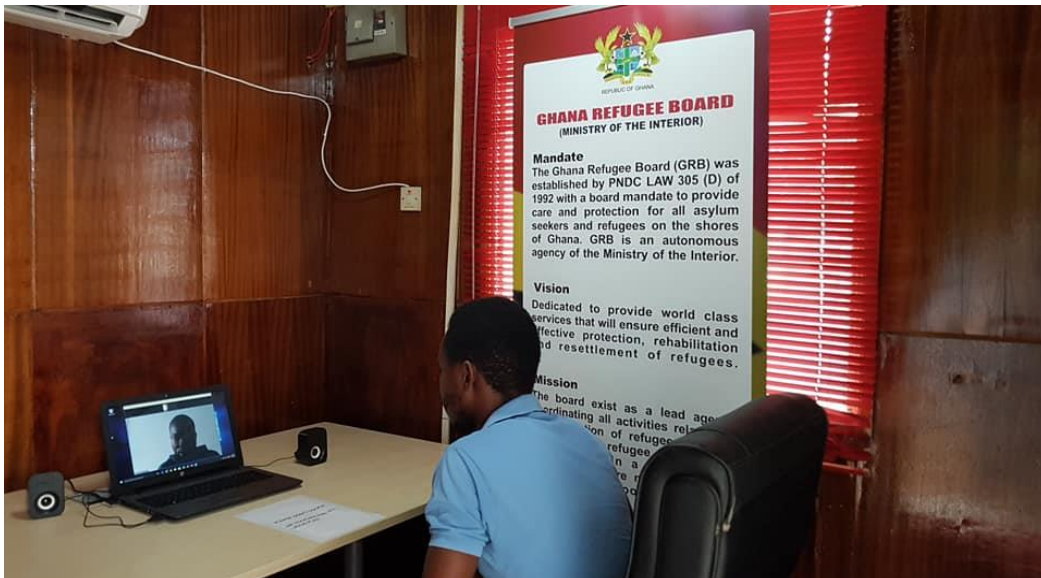
An Asylum Seeker going through the RSD interview in Ghana.