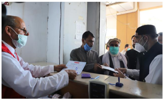
At Golra Post Office in Islamabad, the Federal Minister for SAFRON presents cash assistance to an Afghan refugee.

On 20 May 2020, UNHCR began the disbursement of emergency cash assistance to the most vulnerable refugee families in Pakistan. Some 36,000 families will be the initial beneficiaries of this emergency cash assistance by UNHCR through the Pakistan Post. It will help the most vulnerable refugee families meet their urgent needs during the COVID-19 pandemic. The emergency cash mirrors the Government's Ehsaas emergency cash programme, where vulnerable families receive Rs.12,000 (approximately $77) to cover a four-month period. Those eligible for the emergency assistance include refugees with disabilities or serious medical conditions, as well as single parents.