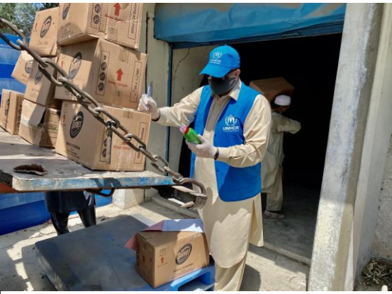
UNHCR staff unload the in-kind donation generously provided by private sector partner, Unilever.

Community engagement through community health workers and social mobilizers is being carried out through shuras and religious leaders. Ensuring distancing protocols are community health workers and UNHCR partner staff held meetings and health education sessions at the community and health facilities levels. UNHCR, through partners, continued to distribute medical supplies, including surgical masks, gloves, gowns and infrared thermometers to frontline medical and partner staff working in health facilities in the refugee villages and communities.