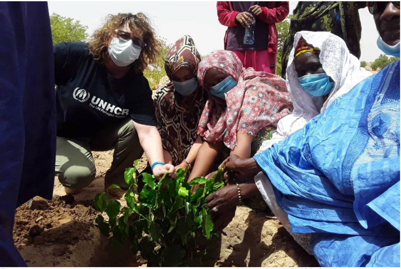
Following a distribution of hygiene products to the health center of Hamdallaye, UNHCR Representative in Niger, Alessandra Morelli, took part in the planting ceremony of a dourmi tree in the village of Beri Koira. Famous for its medicinal and healing properties, this tree is a symbol of the collective fight against COVID-19.