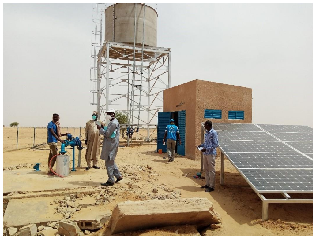
A solar powered well in Assaga, Niger as part of the EU Trust Fund Project on Urbanization in the DIffa region led by UNHCR.

water supply from boreholes and treatment plants to refugees continued. Meanwhile, excavation of a large size waste pit was completed at the Ukende Settlement to improve environmental sanitation. Decommissioning of filled-up latrines were also undertaken in the settlements.