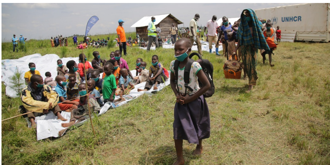
Asylum seekers from the Democratic Republic of the Congo (DRC) are received at Gulajo border point in Zombo district, as Uganda temporarily reopened its border on 1-3 July 2020 to grant asylum to thousands of people fleeing violence in eastern DRC.