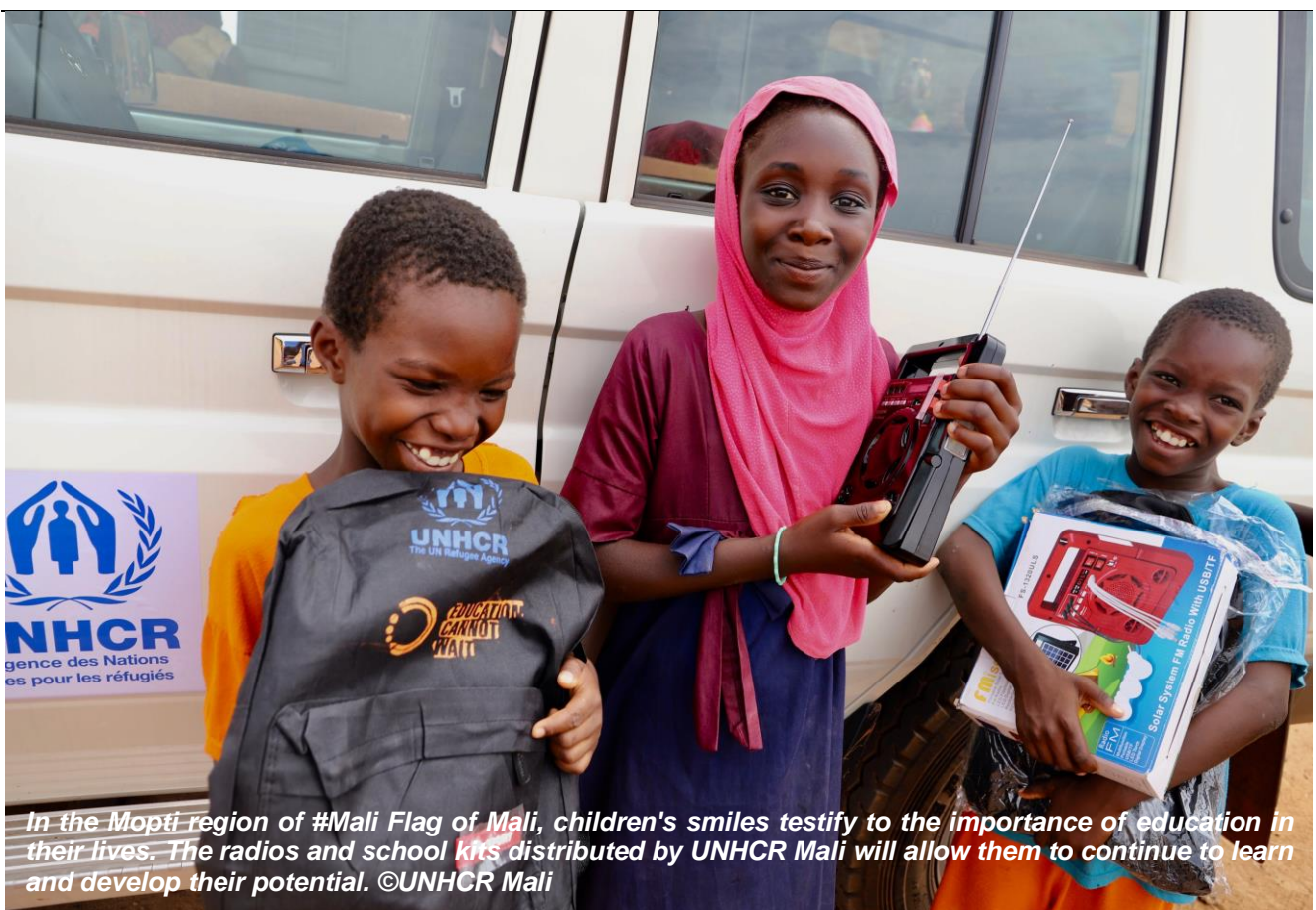
In the Mopti region of #Mali Flag of Mali, children's smiles testify to the importance of education in their lives. The radios and school kits distributed by UNHCR Mali will allow them to continue to learn and develop their potential.