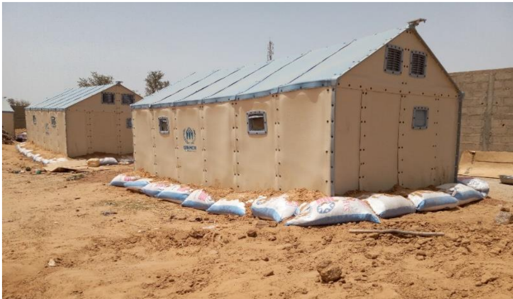
In Burkina Faso, RHUs were built to provide sturdier homes to IDP families affected by the heavy rainfalls and the floods in Wendou in the Sahel Region.

In this uncertain and challenging context, the COVID-19 pandemic is now accelerating in West and Africa, moving from the main urban centers into the remote rural areas where it will be more challenging to contain the spread of the virus.