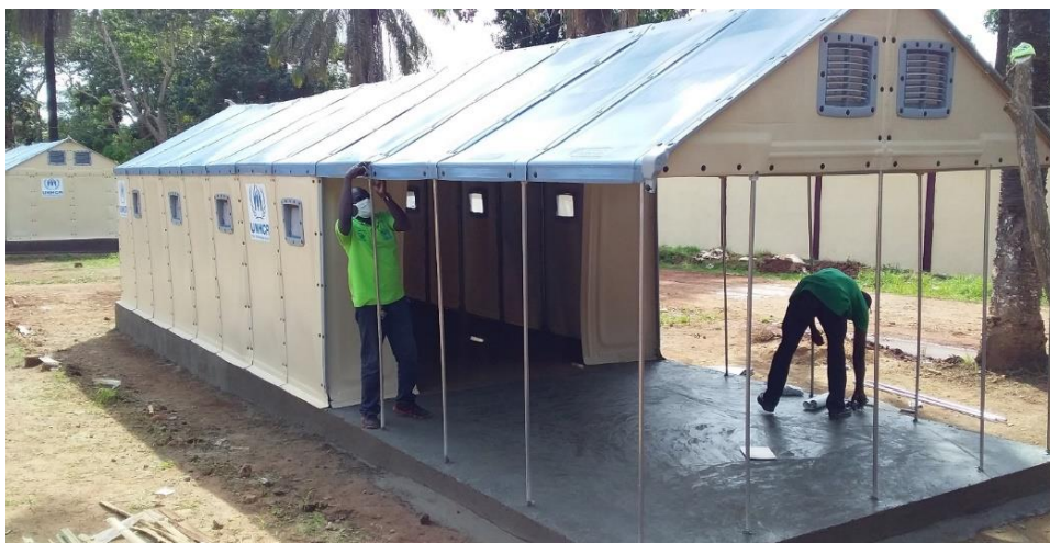
Installation of RHUs by UNHCR's partner AIRD at the University Hospital of Bambari.