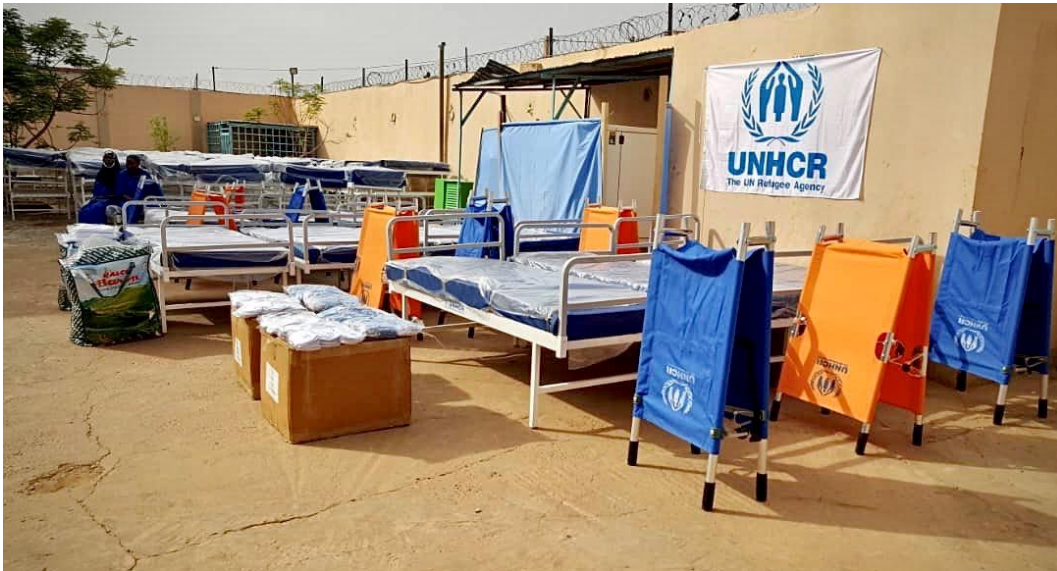
Part of the medical equipment donated by UNHCR to the Malian authorities in the Gao region to support their response to COVID-19.

UNHCR trains health staff and community health workers around the whole country and distributes medicines and medical supplies across the country.