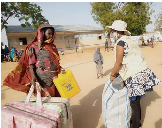
Beneficiaries of non-food items in Gwoza, Borno State.

05 Field Units in Gwoza, Bama, Monguno, Ngala, Banki