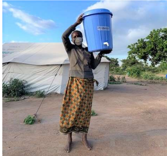
A woman receives a bucket and soap for handwashing as part of COVID-19 prevention in Sofala Province, Mozambique

3,097 calls received on UNHCR's Helpline in South Africa since the beginning of the COVID-19 lockdown, mostly from refugees and asylum-seekers requesting assistance with food and rent.