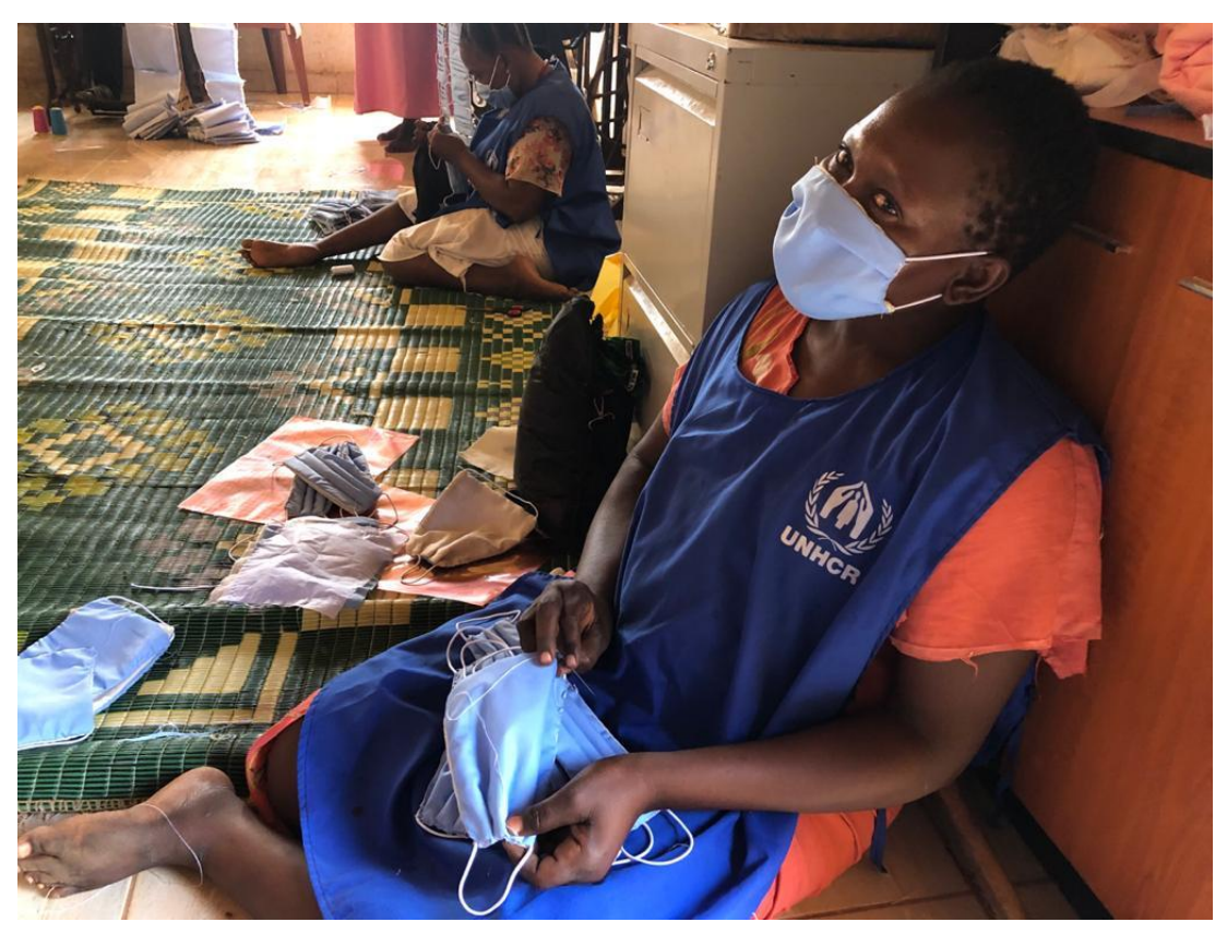
UNHCR and Women Development Group work with a group of forcibly displaced woman with disabilities to produce face masks. So far, they have produced 9,000 masks with 60% distributed to vulnerable people in Wau, including those working on the frontlines of the COVID-19 response.