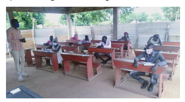
UNHCR partner Jesuit Refugee Service held COVID-19 awareness sessions with the primary school teachers in Maban to ensure COVID-19 preventive measures are followed by listening groups during broadcasted school lessons.

Cross border movements continue unhindered mostly through unofficial crossing points despite COVID-19 border restrictions. To address this, UNHCR co-facilitated a workshop for the points of entry working group on border crossings;