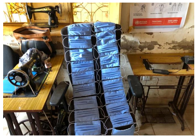
Masks being produced by a group of forcibly displaced woman with disabilities.