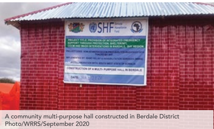
A community multi-purpose hall constructed in Berdale District Photo/WRRS/September 2020

1866 complaints were recorded by CCCM partners during the month of September with a total of 84% complaints closed by partners during the month.