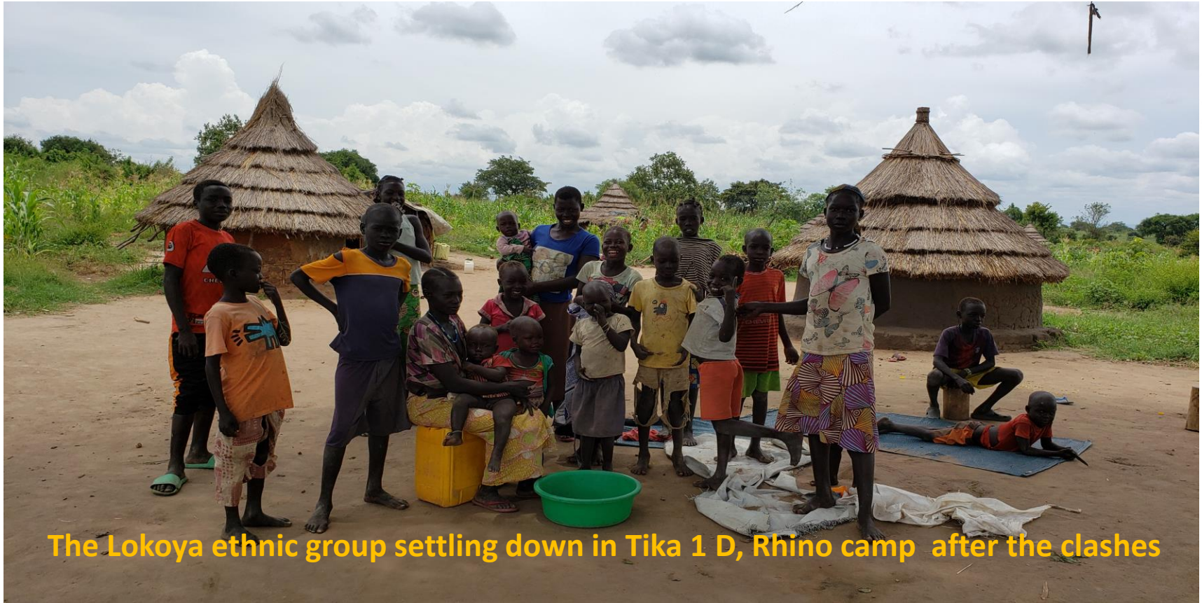
The Lokoya ethnic group settling down in Tika 1 D, Rhino camp after the clashes

Presentation by Operations Unit UNHCR Uganda 16 October 2020