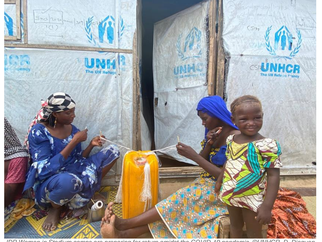
IDP Women in Stadium camps are preparing for return amidst the COVID-19 pandemic.