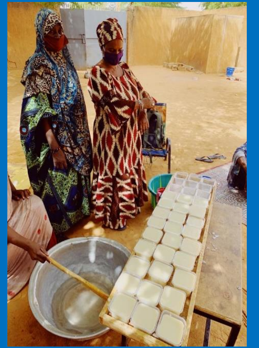
Soap production by refugee in Niger as part of UNHCR's COVID response.

Beyond the positive results in terms of emergency response, this activity is an excellent temporary replacement for many psychosocial activities who have to be put in stand-by due to the forced social distancing required by the COVID-19 situation. The activity also help many vulnerable displaced persons to cope with the situation and to develop hope and resilience in their current situation.