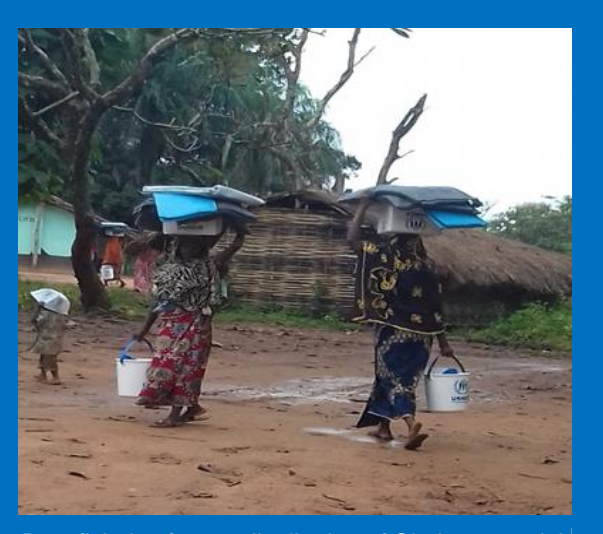
Beneficiaries from a distribution of Shelter materials and NFIs in Bambari in October 2020.

Although the number of returns has decreased significantly in 2020, due to the COVID-19 and the restrictions to international and domestic movements, refugees from Central African Republic have been returning from neighboring Cameroon, Republic of Congo and DRC to their places of origins. Despite the operational challenges caused bv the pandemic, UNHCR has facilitated over 1,500 of these returns and applied preventive measures to mitigate the risk of COVID-19 infection. These measures included enforcing social distancing in