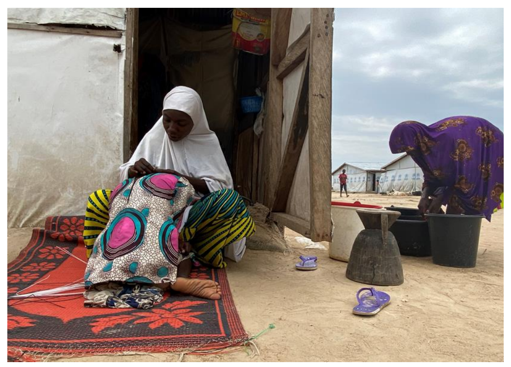
IDP Women in Northeast Nigeria preparing for return home with the assistance of UNHCR. ©UNHCR, Danielle Dieguen Oct. 2020

forcibly displaced population is also increasing the risk of resorting to negative coping mechanisms, including child labour which UNHCR is monitoring closely.