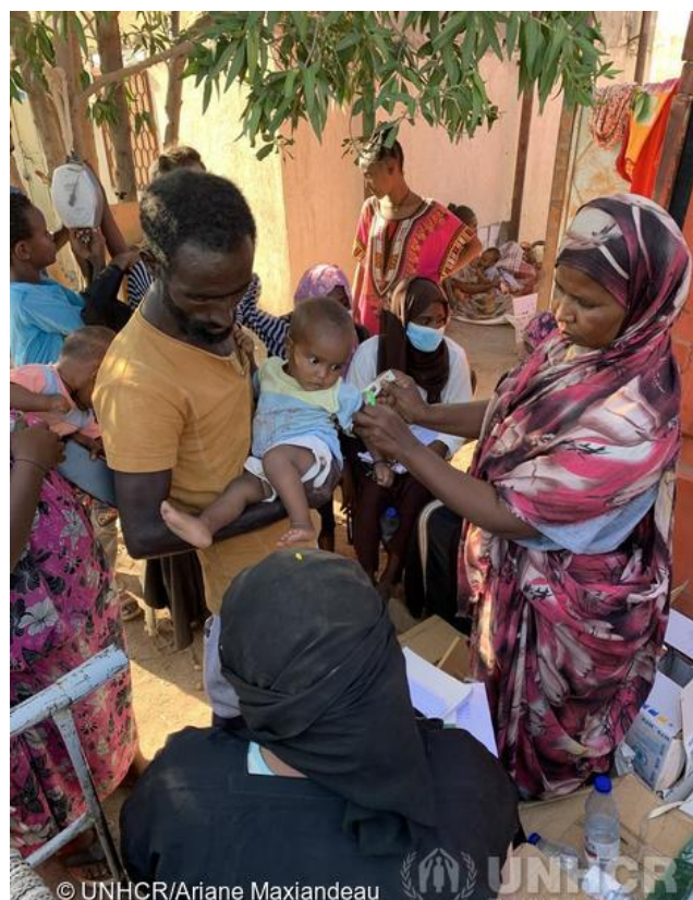
Health officials conduct nutrition screenings to newly arriving Ethiopian refugees at Hamdayet transit site.

UNHCR and COR continue to relocate refugees from the Hamdayet transit centre to the new settlement site Um Raquba in Kassala State. An additional site at Tenetba near Fau 5 has been identified, but it will