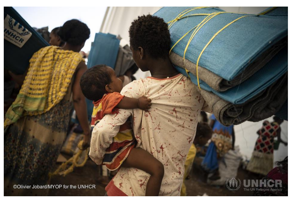
Ethiopian refugees collect blankets and mattresses at Hamdayet reception centre in Sudan, where days are intensely hot and night-time temperatures plummet.