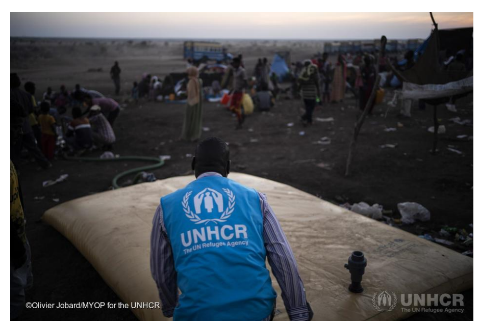
A UNHCR staff member activates a water pump for Ethiopian refugees to fill jerrycans at a transit site in Hamdayet, Sudan.

Hamdayet in Kassala State: In Hamdayet, nearly 20,000 people remain at the registration centre and further into the town and host community. UNHCR has set up an electronic registration and case