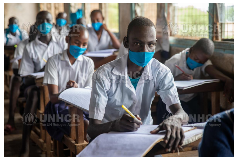
Grade 8 students at Arid Zone Primary School, Kakuma attend a language lesson while wearing facemasks. UNHCR and partners are implementing COVID-19 protocols to ensure a safe environment for refugee students and teachers and are supporting host-community schools.

In Rwanda schools and institutions of higher learning reopened on 2 November and students' return to school continued to be monitored throughout the month as the students gradually re-enrolled back to school. The Government proposed to continue to deliver distance learning programs even after the schools reopen to enhance and improve quality of education for the students. UNHCR anticipates receiving a donation of solar powered radio's, tablets and laptops for this purpose from TRANSSION company.