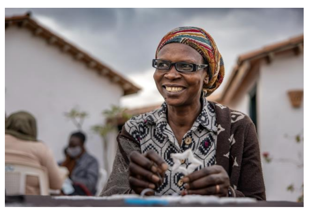
Refugee and artisan from Tanganyika Province in Democratic Republic of the Congo, carves wooden holiday ornaments for Made51 from his workshop in Nairobi, Kenya.