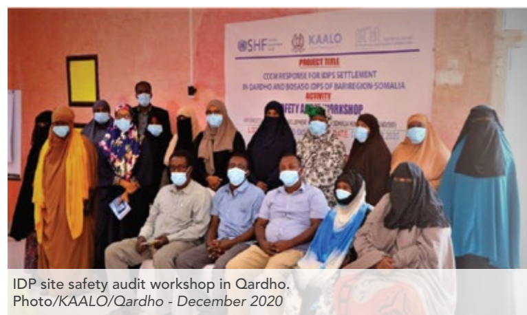
IDP site safety audit workshop in Qardho. Photo/KAALO/Qardho - December 2020

CCCM partners continue to respond to the IDP site needs caused by Cyclone Gati in Bari region. Thus far, partners have conducted site maintenance activities aimed at improving living conditions of IDP populations that have been adversely affected by Cyclone Gati. CCCM partners were able to coordinate with service providers to avoid duplication and ensure inclusivity of delivered services.