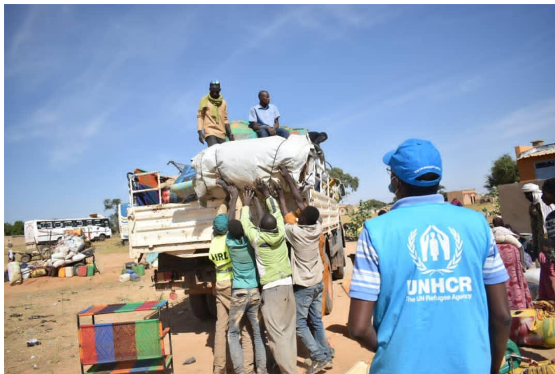
Relocation of refugees is ongoing in Goudoubo camp near Djibo, in the North-East of Burkina Faso

from the border, to ensure their effective protection and ease the pressure on host populations of the border area. As of 15 of December, 10,447 refugees have been relocated out of the 12,000 planned for 2020. The assistance provided by UNHCR and its partners also targets the host populations of these traditionally underserved areas, where basic infrastructure and public services are lacking.