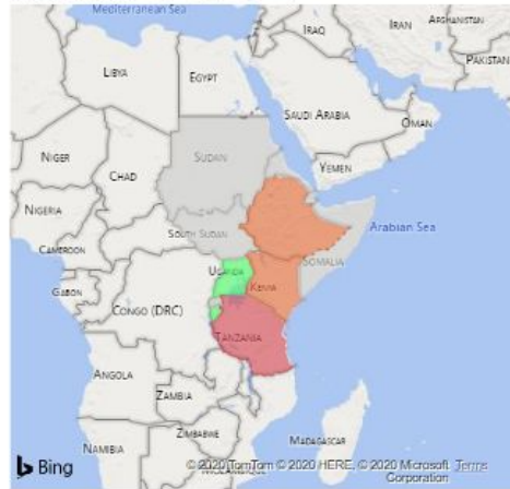
Countries and Bank Account