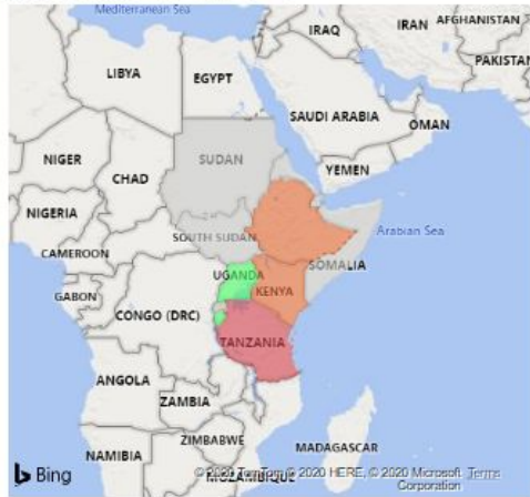
Countries and Mobile Money