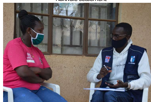
Image 1: Key Informant Interview in session in Nakivale settlement