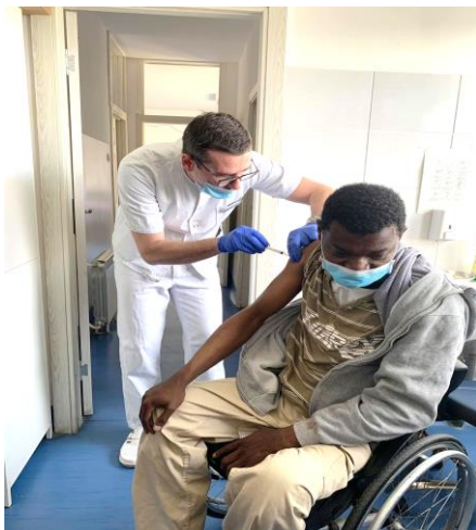
Vaccination against Covid in Krnjača Asylum Centre in Belgrade, @UNHCR, 26 March 2021

On 26 March, Serbian authorities began a campaign of vaccination of refugees, asylum-seekers and migrants accommodated in 19 governmental centres across the country. Serbia became amongst the first countries in Europe to start vaccinating both refugees and asylum seekers in the centres and those accommodated privately. Five hundred and fifty refugees and migrants in government centres expressed interest in vaccination and 309 have been vaccinated by end-March. Additional 32 privately accommodated refugees have also been vaccinated against Covid. To promote vaccination, Batut Institute for Public Health, UNHCR, Serbian Commissariat for Refugees and Migration (SCRM) and WHO sensitized the refugees and migrants in terms of health promotion and protection from Covid.