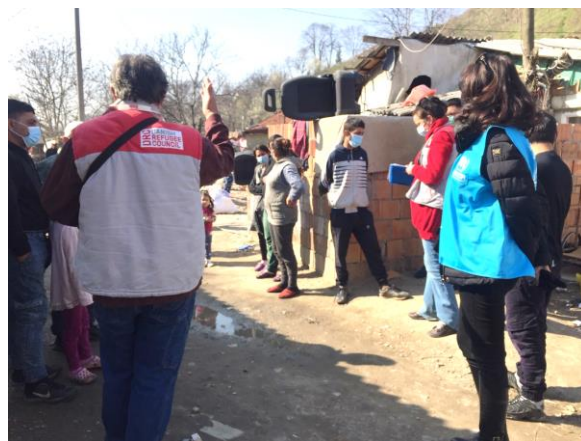
Joint health promotion activities of UNHCR and DRC in Tosin bunar informal Roma settlement, Belgrade, @UNHCR, 19 March 2021

The number of residents in Asylum (AC) or Reception/Transit Centres (RTC), again slightly decreased compared to end-February to 4,460 at the end of March 2021. They comprised 1,754 citizens of Afghanistan, 888 of Syria, 317 of Pakistan, 206 of Somalia, 188 of Bangladesh and 1,107 from 50 other countries. 3,797 are adult men, 256 adult women and 407 children, including 74 unaccompanied and separated children (UASC). A total of 5,463 new refugees and migrants were counted to be present in the country at end-March , including those staying outside of governmental centres. The authorities continued systematically gathering refugees and migrants staying outside the centres, in downtown Belgrade and in border areas, and transferring them to official centres with vacant places.