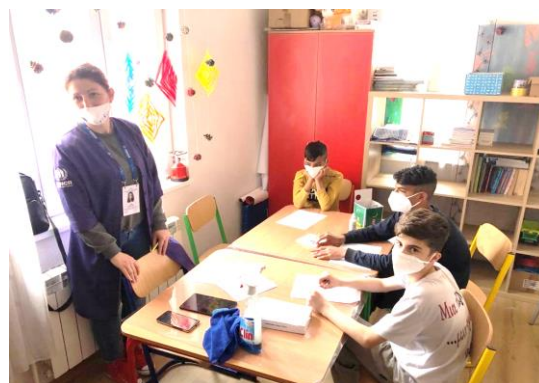
Non-formal educational workshop in Bosilegrad RTC, @Indigo, March

UNHCR corporate partner IKEA SEE issued a call for applications for re-skilling programme for refugees and asylum-seekers in Serbia , in order to enhance their employment prospects.