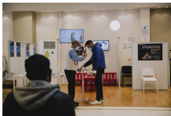
At the urban cash centre, asylum-seekers can apply and receive cash assistance as part of UNHCR's programme co-funded by the European Union. March 2021.

spend it in what they need most, such as food or medicine. Cash assistance also contributes to the local markets. This month, 7.1 million euros were eventually channelled into the Greek economy.