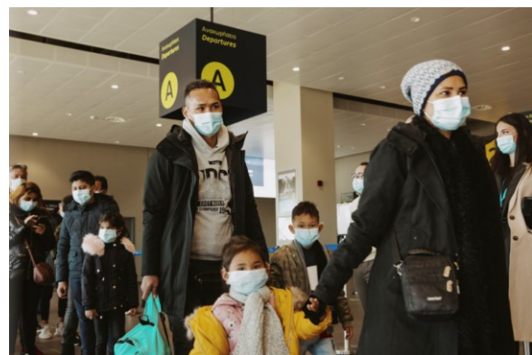
A family of Afghan refugees walk towards their boarding gate at the Mytilene airport, travelling from Lesbos to Germany, as part of the European relocation scheme. February 2021.

Since April 2020, 3,654 asylum-seekers and refugees have found a new home in other European States in the context of the current Europe-wide relocation scheme – a concrete gesture of solidarity to Greece. Amongst them are unaccompanied children, and children with medical needs and their family members. The European Commission-funded programme is implemented by UNHCR, IOM, UNICEF and EASO in cooperation with the Greek Government. Sixteen European States have committed to receiving 5,200 asylum-seekers and refugees, including 1,600 children who are on their own in Greece.