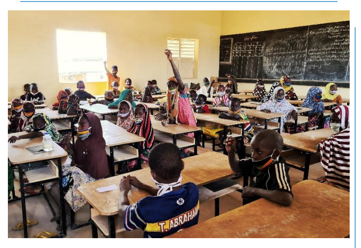
Malian refugees, internally displaced and host community students attending classes in Ouallam