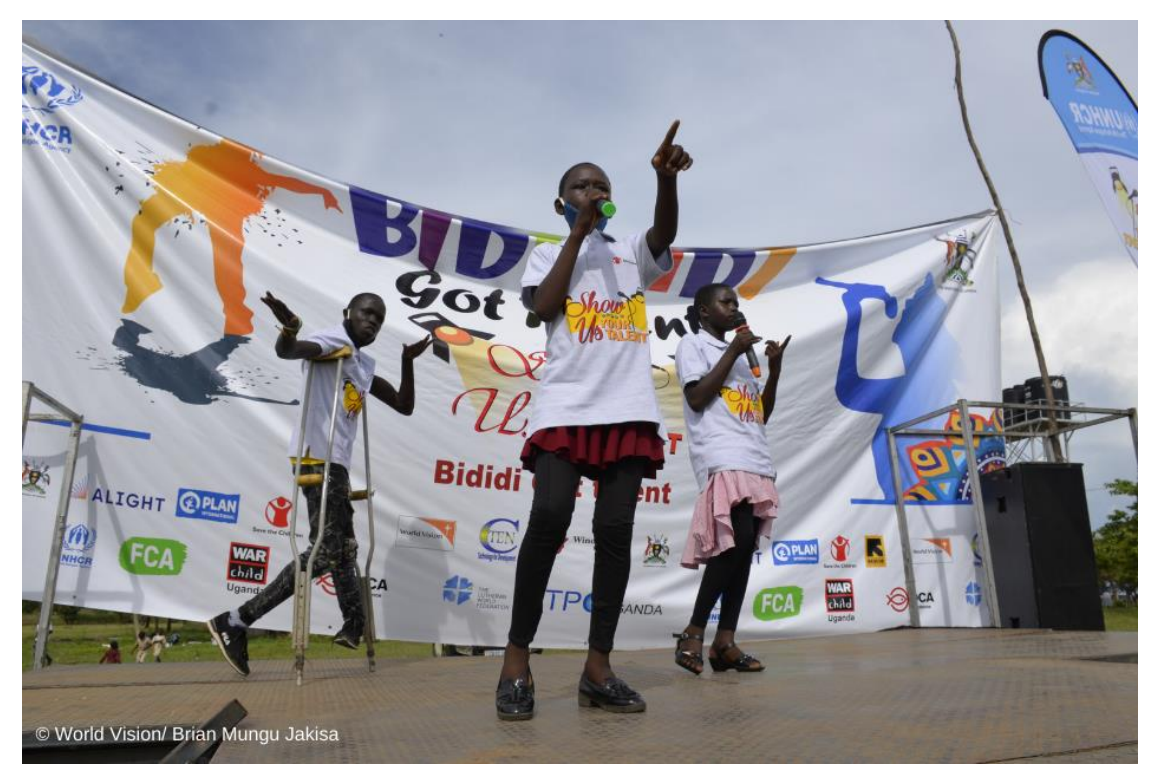
Winners in 'Bidibidi Got Talent' music category, present during the grand finale held on 29 April in Bidibidi settlement, Yumbe district