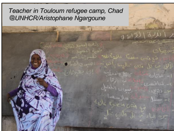
Teacher in Touloum refugee camp, Chad

Since the start of the Covid-19 pandemic, increased support has been provided to teachers in refugee camps in Chad, both during the period of school closure to ensure continuity of learning for students, and after school reopening to ensure a safe return to classes .