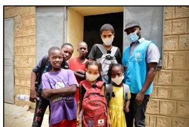
Children in front of a new classroom in Timbuktu, Mali @UNHCR Mali

In Mali , three new fully equipped classrooms have been handed over this month by UNHCR to Timbuktu education authorities. Thanks to Japan’s Emergency Grant Aid , since last year UNHCR Mali has constructed, rehabilitated and equipped 30 classrooms in IDP, refugee and returnee hosting areas in central and northern Mali. The project also included distribution of learning materials for 1,500 school age children, and teacher training on inclusive education, psychosocial support, peace education and education in emergencies. The project