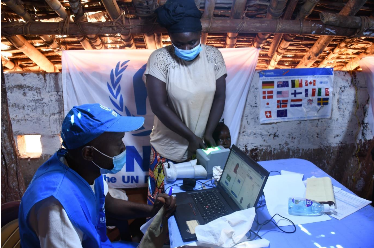
UNHCR/ CNR register newly arrived asylum seekers from CAR in Ndu, Bas-Uele Province