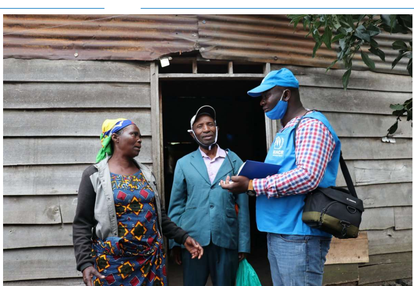
UNHCR continues to assist people affected by the eruption of the Nyiragongo volcano in Goma, North Kivu Province.