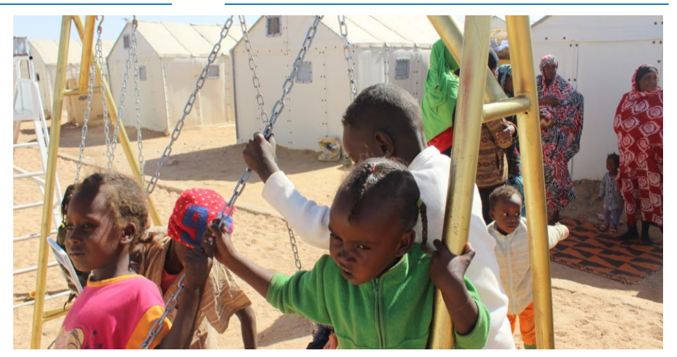
Refugee children awaiting resettlement playing at the humanitarian center in Agadez