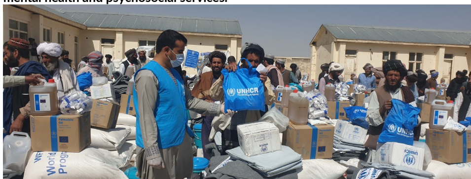
Internally displaced Afghans in Zabul province collect core relief items including hygiene kits, food items and water and sanitation items in August 2021.