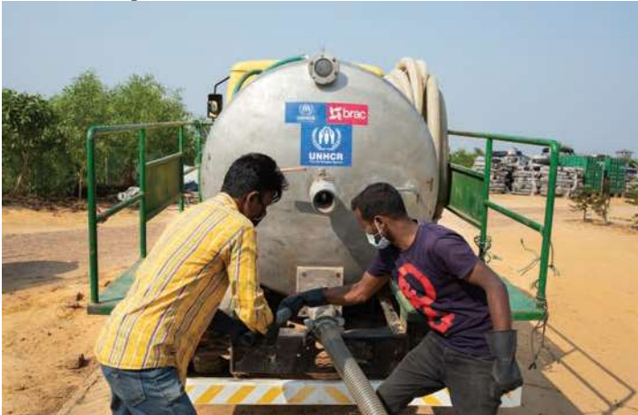
UNHCR works with multiple partners, as well as more than 500 WASH volunteers to maintain water, sanitation and hygiene standards. UNHCR has established thousands of communal latrine facilities; the fecal sludge from these facilities is treated in one of the fecal sludge treatment plants.