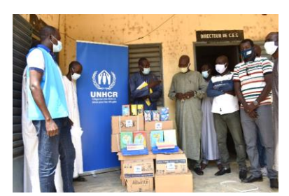
Delivery of administrative material to the Lycée Collège de Diguel Est

2,199 urban refugee students (50% girls) were assisted with cash to support the financing of their schooling. This school assistance was followed by visits by the refugee community focal points to check the children's schooling. In addition, the 5 schools in N'Djamena hosting the most urban refugees were supported with administrative supplies. The UNHCR Computer Center , despite its closure due to COVID-19, continued to build the capacity of young refugees through distance training. Seven weeks of computer training were organized with the participation of 72 refugees, including 26 women.