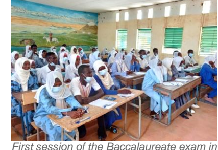
First session of the Baccalaureate exam in Iriba

1,539 refugees (931 girls) obtained their lower-secondary certificate (Brevet d'Études Fondamentales – BEF) in 2021, a pass rate of 85% and 295 more graduates than in 2020. 616 (100 more than in 2020) refugees obtained their Baccalaureate including 342 girls, representing a 53% success rate. Compared to the 2020 sessions, the BEF pass rate is 6 points higher and the Baccalaureate 10 points higher. The success rates of refugees are also higher than the national rates which are 74% for the BEF and 46% for the Baccalaureate. Note that 97 refugees obtained their Baccalaureate with honors.