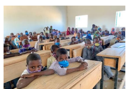
Primary classroom at Dar Es Salam camp