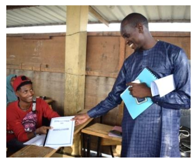
Tutoring session in N'Djamena

During the school year, over 3,000 students and parents were trained to strengthen engagement and make schools more autonomous. In eastern Chad, Parents' Associations were thus been able to finance the construction and rehabilitation of infrastructure (ex: classrooms and fences), as well as purchase or repair school equipment. Girls' clubs set up in each camp continued their strong mobilization. In N'Djamena, the Urban Refugee Student Committee organized a tutoring system to support 87 refugees studying for the Baccalaureate exam, and also organized a blood donation campaign. In all camps and in urban areas, refugee focal points lend a hand to UNHCR and its partners on a daily basis.