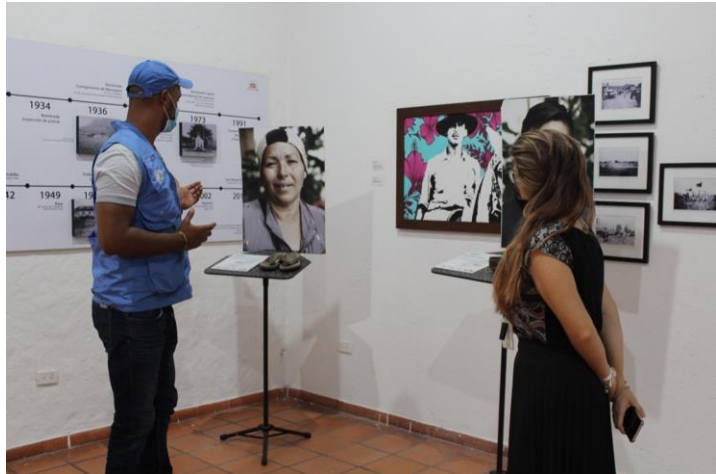
'Footprints and Face of People in Transit' exhibition at the Museum House Ocho de Julio in Yopal, Casanare.