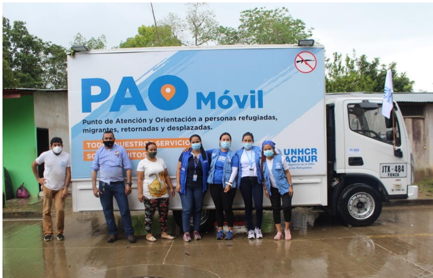
An Information and Orientation Mobile Unit (PAO) in Arauca providing services to Venezuelan refugees and migrants, Colombian IDPs and returnees in the rural areas of Arauquita