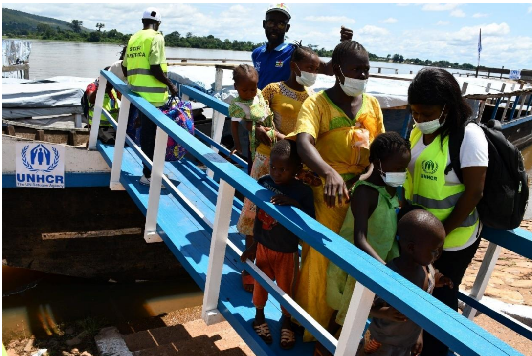
CAR refugees disembark at Port Amont, Bangui, following voluntary repatriation from Mole camp, South Ubangi Province

In South Ubangi Province, 81 CAR refugees at the Mole and Boyabu camps received the second shot of the AstraZeneca vaccine against Covid-19.