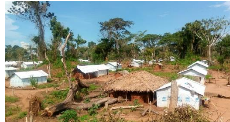
New shelters are being built to provide decent accommodation for refugees at Modale settlement