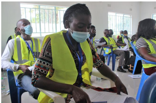
Survey enumerators participate in a training to prepare for the interview phase of Return Intention Survey of the Congolese refugees in Mantapala settlement