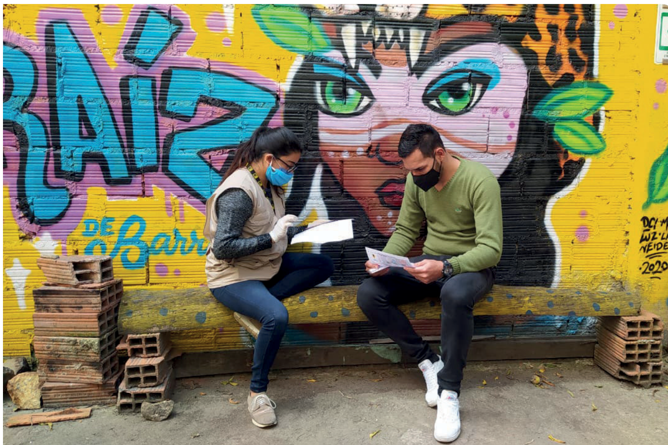
Bogota, Colombia

While the focus of the research was on governments, humanitarian and development partners - as well as broader civil society at the global, regional, and country level - were engaged to get their perspectives on research questions. The research did not include engagement with local civil society actors and refugee and host communities themselves, given the target of governments. Their perspectives and important voice, particularly when discussing the impact of changes in refugee policy and practice, should be included in follow-up regional and country research on GCR implementation.