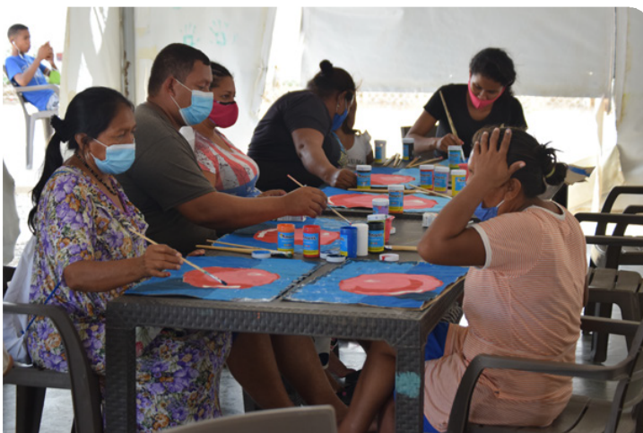
Colombia – DRC

The true trendline insofar as third country solutions are concerned will only become clear once international travel returns to some semblance of pre-pandemic levels and major events, such as the resettlement of Afghan refugees, are discounted as exceptions. Over the course of the last few years, a number of other countries have signalled their commitment to third country solutions as crucial tools for protection and solutions.