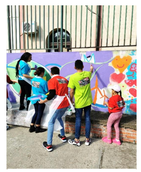
Refugee and Roma children painting a mural of friendship on the walls of Branko Pešić School in Zemun, Belgrade, Oct 2021

On 1 October, UNHCR/UNDP Young Volunteers project team organised a one-day event in the backyard of "Branko Pešić" school of further education in Zemun, which educates local and refugee children, gathering round schoolchildren, UNVs and unaccompanied and separated children from specialised institutions. The local and refugee youngsters involved in mural painting, which earned significant media coverage, sports, music and dance activities and competitions.