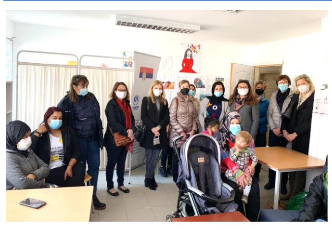
International Women's Club of Belgrade delivering humanitarian assistance to families with children in Krnjača Asylum Centre, Belgrade, @IWC, 1 Nov 2021

Over 100 refugees and asylum-seekers were assisted by UNHCR and partners in October in opting for local integration through finding employment opportunities and/or private accommodation, support to starting a business, support to education/reskilling and classes in Serbian language; 16 households/35 persons will be supported by UNHCR in November through cash-based intervention and one-time winterization allowance.