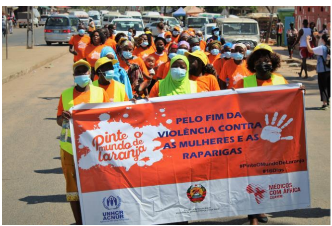
16 days of Activism Against GBV march organized in Pemba, Cabo Delgado, to raise awareness on GBV and services available to GBV survivors