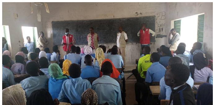
UNHCR and the national Red Cross in Chad discuss mixed movements with communities

UNHCR supported States in the region with the establishment and reinforcement of quality and accessible national protection frameworks and systems. In Burkina Faso , UNHCR advocated for the reform of the asylum law in line with relevant standards and supported the adoption in January 2022 of secondary legislation laying down the role, composition and working modalities of the National Commission for Refugees. In Côte d'Ivoire , UNHCR provided legal and technical assistance to the authorities with the introduction to Parliament of a draft bill expected to become the first legislative framework regulating asylum in the country. In Gabon , UNHCR and the UN Office on Drugs and Crime (UNODC) advised the Ministry of Justice in the context of the reform of the Criminal Code to decriminalise the rescue of and assistance to asylum-seekers and migrants at sea for humanitarian reasons. In Guinea , UNHCR supported the Government with the development of secondary legislation facilitating the implementation of the 2018 asylum law.